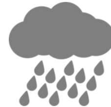
LOW-IMPACT DEVELOPMENT AND GREEN INFRASTRUCTURE