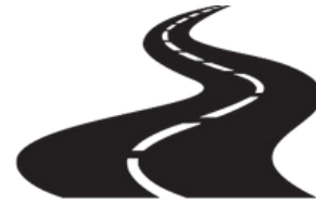
ROAD AND HIGHWAYS